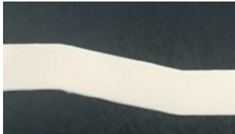
Angled section to increase the surface area coverage of the airway device