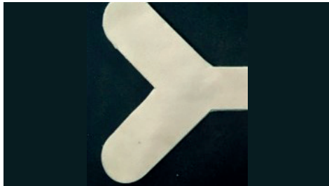
V-Shaped end facilitating optimal fixation to the mandible and maxilla